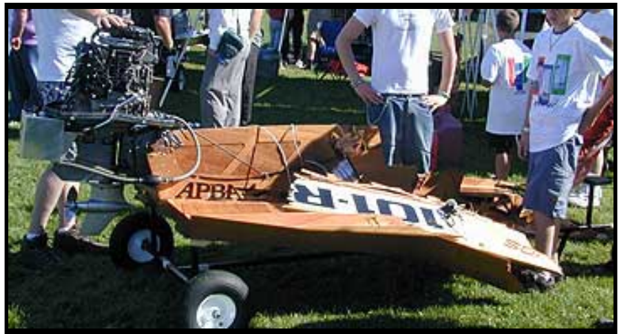
The result of a very scary moment. Here's Todd Cragin's D-Stock Hydro after a nasty three-boat first-turn crash. No injuries, but an ample reminder of the need for care.

At about the middle of the first turn Todd Cragin's boat climbed up on another racer's fin