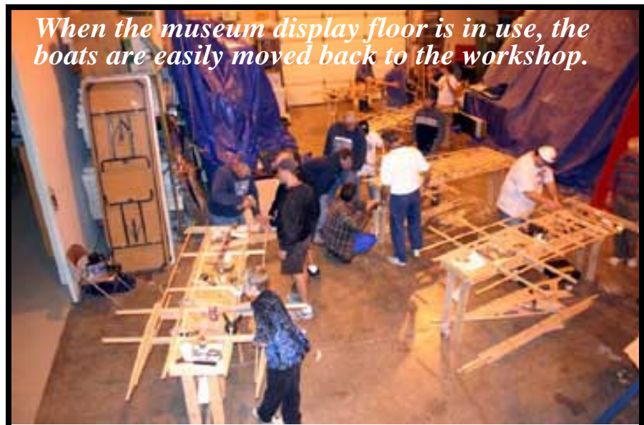
When the museum display floor is in use, the boats are easily moved back to the workshop.

Those who've attended meetings at the Kirkland Eagles should be familiar with the Wing Dome, the little eatery next door. Wing Dome now provides a $10 food card as a raffle prize. Wing Dome also offers takeout and will deliver if they aren't too busy. What a deal!...An SOA meeting and a chance to win free food. Golly! what next?